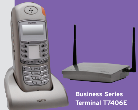
Business Series Terminal T7406E

* This product is available in North America, Mexico and Caribbean countries (except for Jamaica and Trinidad) only.