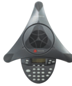
SoundStation® IP 4000

The smallest and most affordable multiperson conference phone. Ideal for offices or small conference rooms.